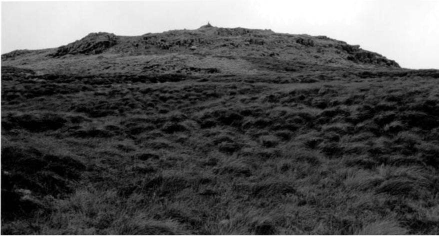
FIG. 3 The crestline crags of Round Knott rise above a gently sloping cover of blanket peat.

moved there: did they move as a set of boulders or collect there and get their present character where they now are? What processes may have been involved in packing and arranging the boulders? These may not be easy questions but the landscape poses them.