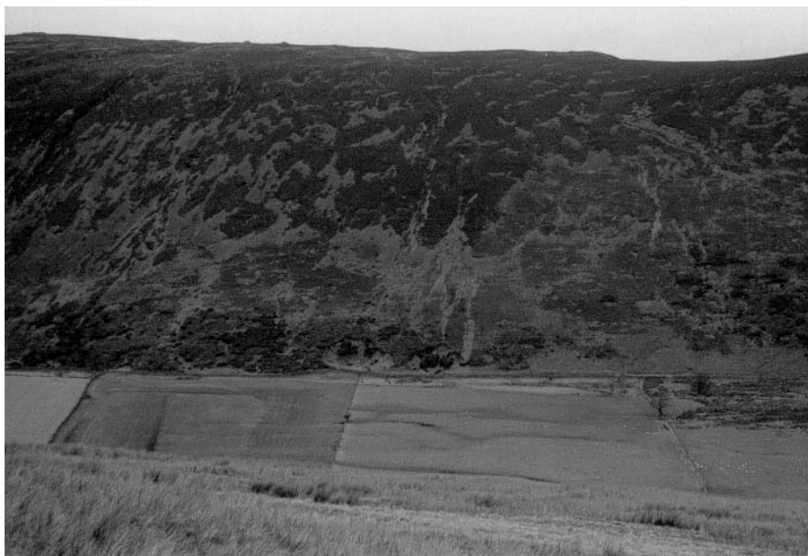
FIG. 5. Mosaic of scree and vegetation patches on the north side of Mosedale. Scree-foot pits (6 on Fig. 1) can be seen in the middle of the photograph. The courses of old stream channels are evident in the enclosed fields of the valley-floor alluvium.

valley at that time. There is also the question of how meltwater discharging into Mosedale from both the ice lobe, from which the sands and gravels may have derived, and ice in the catchment of the upper Caldew escaped from the valley. Are there any shoreline remnants or other evidence that might indicate the former existence of an ice-dammed lake? As to the possibility that the bench may be built of material from the valley sides, the north side is the more obvious candidate. Comparison between hillside deposits, for example as exposed in the roadside pits further west (6 on Fig. 1), and material making the bench would prove instructive. Present exposures on the bench are small and confined to the southern flank. As much information as possible has to be drawn from them about manner and direction of debris transport and origin of the material and care must be taken over extending conclusions to the rest of the bench.