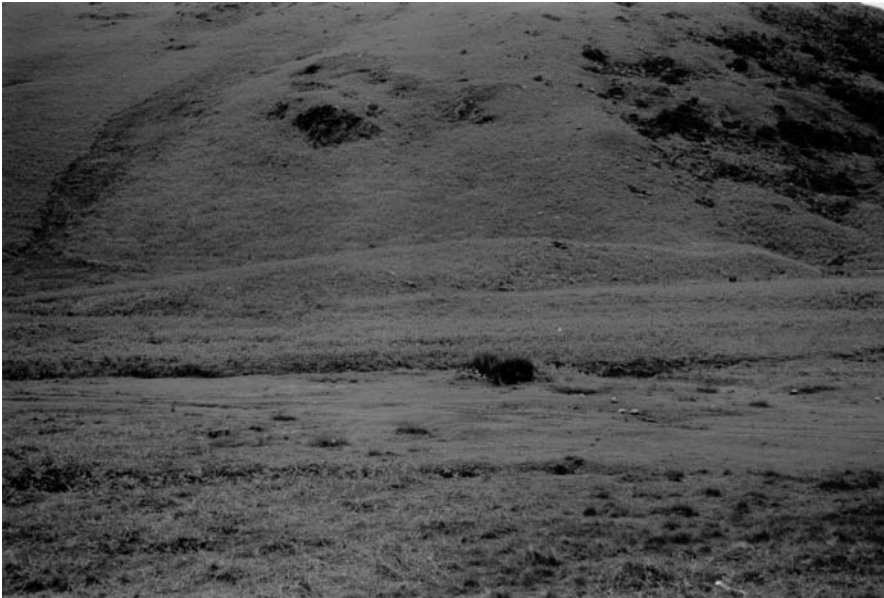
FIG. 7. The slope-foot ridge at the western end of the Ling Thrang Crags recess. In front of the ridge and right of centre a low river-cut bluff separates a terrace from the floodplain of the River Caldew.

poorly-sorted and matrix-supported; most clasts are either angular or subangular with edge-rounding, some clasts are striated, and all are of Skiddaw Group rocks.