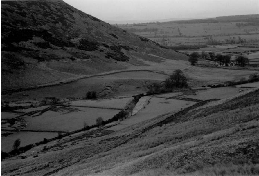
FIG. 4. The bench of 'glacial' sediments (5 on Figure 1) on the north side of Mosedale.