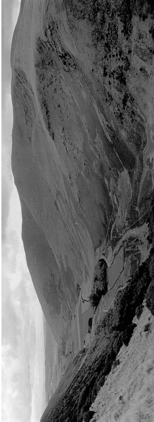
FIG. 6. The south side of Mosedale, showing from left to right the recesses of Drycomb, Bowscale Tam cirque and Ling Thrang Crag.