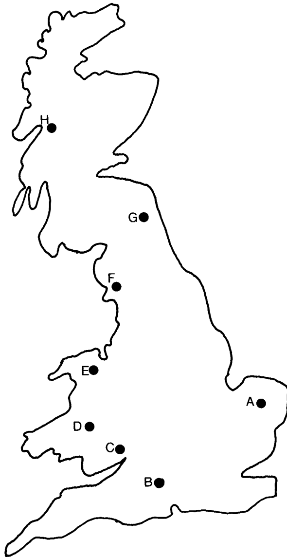
FIG. 1 Distribution of the quadrat samples.