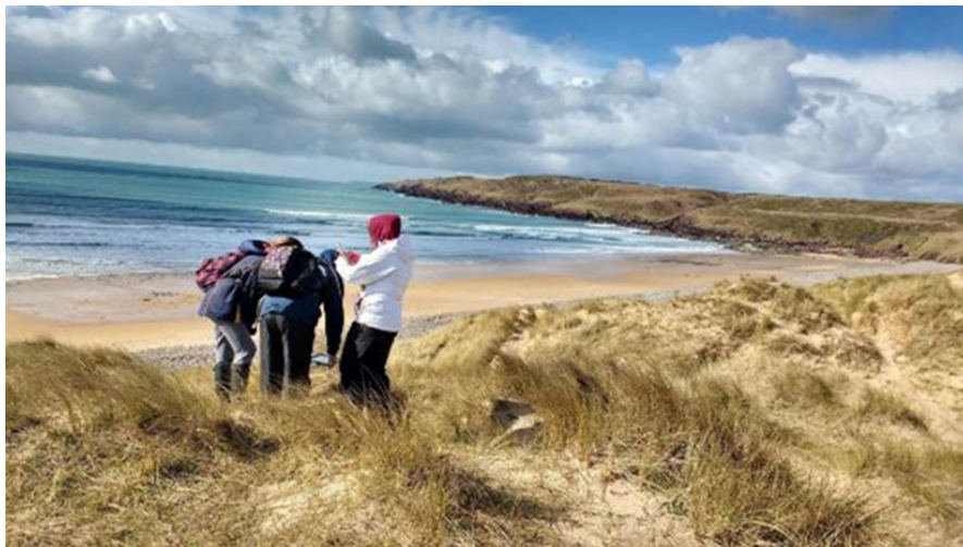
FIGURE 1. Students sampling a fore dune at Broomhill Burrows, Pembrokeshire.

At Orielton Field Centre we use Broomhill Burrows sand dune system at Freshwater West (SM890004) as our field site to investigate the process of succession (Figure 1). Broomhill Burrows is a SSSI within the Pembrokeshire Coast National Park. As well as being one of Pembrokeshire’s largest dune systems, it also has the most extensive and diverse dune slack vegetation, with a mixture of short dune turf, gorse scrubland and moss-dominated grey dunes (CCW, 1987).