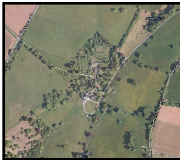
Map 1- Nettlecombe court (maps.google.co.uk)

Nettlecombe court has possessed a meteorological station for a number of years and so a summary of "MET" data has been included in this report.